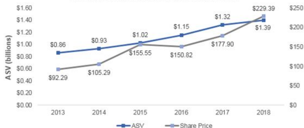
Consistent Growth in ASV and Share Price

ASV is used as the primary metric in our annual incentive plan. As illustrated in the graph below, ASV has grown by 62% since 2013 and has been strongly correlated with stock price growth.