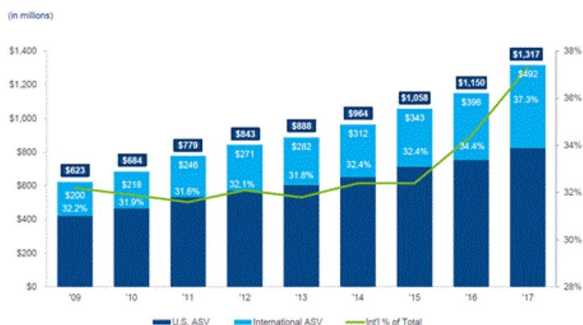
Total ASV and International ASV Growth

The following chart provide a snapshot of FactSet’s historic ASV growth: